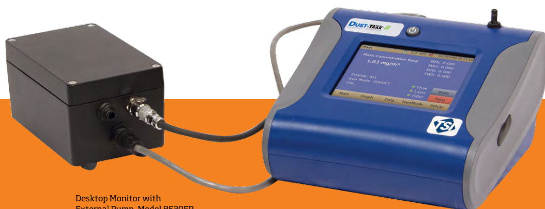
Desktop Monitor with External Pump, Model 8530EP