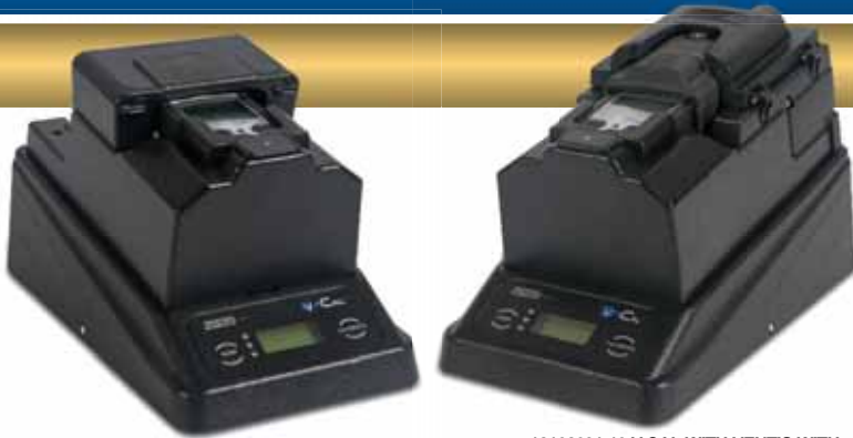
18108631-00 V-CAL WITH VENTIS INSTRUMENT* (*monitor not included)