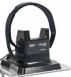
18108653 TRUCK-MOUNT CHARGER, HARD WIRED