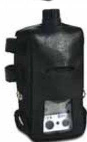
18108810 VENTIS WITH PUMP SOFT CARRYING CASE