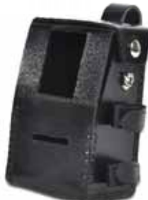
18108811 VENTIS WITH PUMP HARD CARRYING CASE WITH DISPLAY