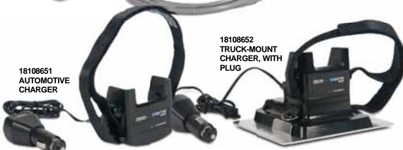
18108651 AUTOMOTIVE CHARGER