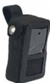
18108175 VENTIS WITHOUT PUMP SOFT CARRYING CASE, LI-ION BATTERY