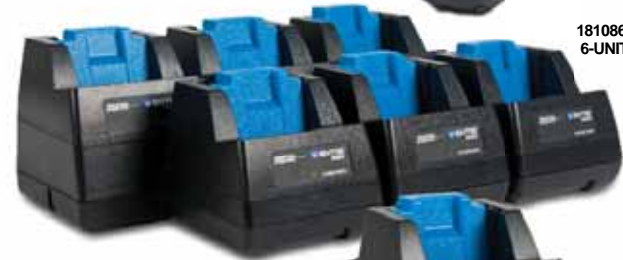
18108650-0 6-UNIT CHARGER