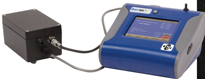
Desktop Monitor with External Pump, Model 8530EP

TrakPro™ Data Analysis Software allows you to set up and program directly from a PC. It even features the ability for remote programming and data acquisition from your PC via wireless communication options or over an Ethernet network. As always, you can print graphs, raw data tables, and statistical and comprehensive reports for recordkeeping purposes.